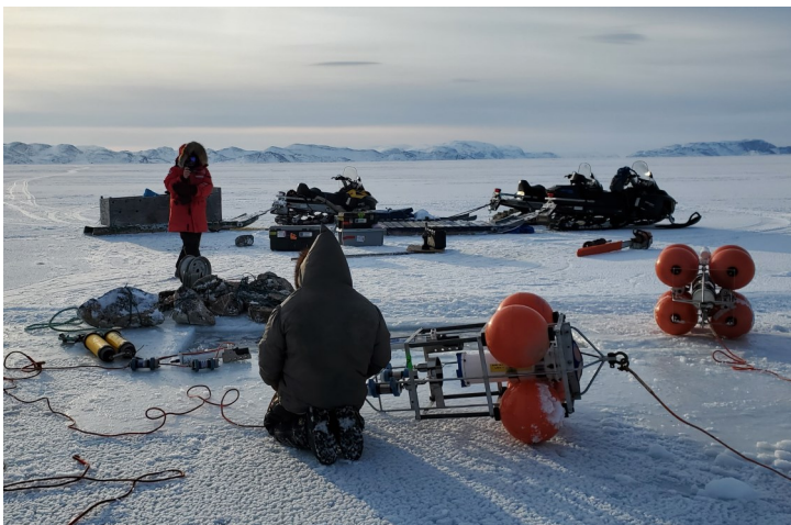
Through-the-ice deployment of the Log IPS on February 15, 2020. The Log IPS mooring cage is shown on the right along with an ADCP cage in the foreground to measure currents.

With this year’s deployment of the AZFP6-ice, further insight will shed light on this dynamic region and provide useful information to help manage the risks associated for those that traverse this area.